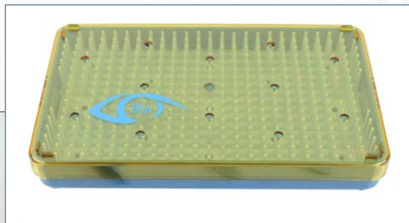
#4004 LARGE #4003 SMALL AUTOCLAVABLE PLASTIC TRAYS