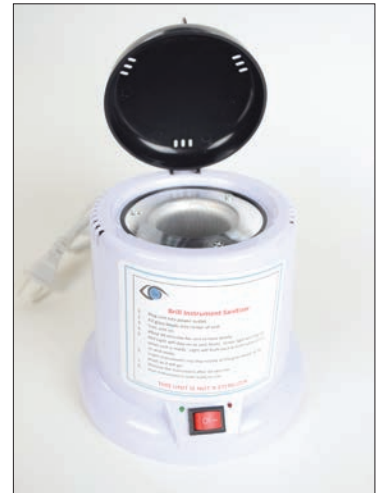
#4001 BRILL INSTRUMENT SANITIZER