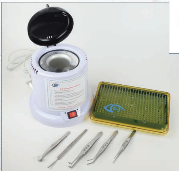
#1150 FIVE (5) INSTRUMENT SET WITH FREE SANITIZER AND TRAY (Select any 5 instruments)