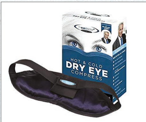
PREMIUM MOIST HEAT DRY EYE COMPRESS TREATMENT KIT